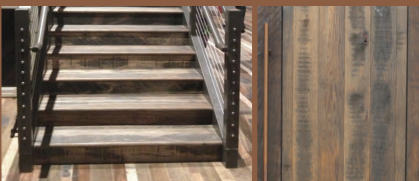
Hickory Stair Treads and Flooring