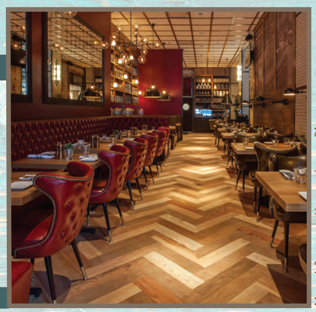
Mixed Species Herringbone Plank Classic Coffers Ceiling/Wall Paneling