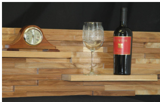
Sample WoodStone Panel with Optional Shelving