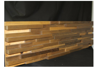
Antique WoodStone Panel