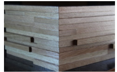
WoodStone System showing a seamless outside corner condition