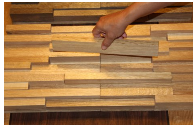
WoodStone System showing insert pieces creating seamless panel joints