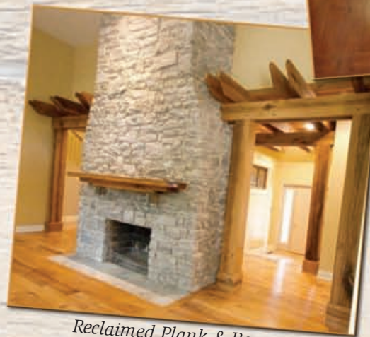
Reclaimed Plank & Beams