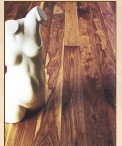
Walnut Wide Plank