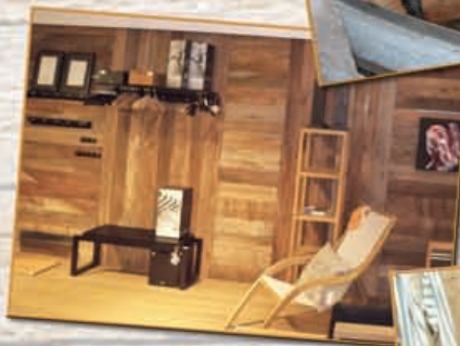
Rustic Wall Panel System