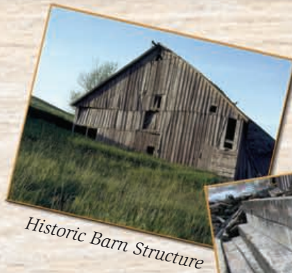
Historic Barn Structure