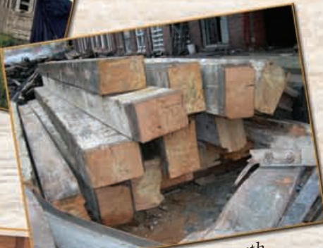
Old Growth Massive Beams