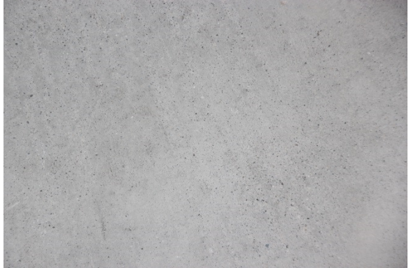
Clean Sub Floor

b) Any cutback/bitumen/tar/asphalt removal process, whether mechanical or chemical, will leave residues in the capillaries and on top of the concrete. These residues must be completely removed by either grinding or shot blasting until grey in color.