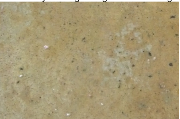
Contaminated Sub Floor

a) What color is the concrete? Concrete is typically grey in color. If concrete is NOT grey, it is either coated with or contains contaminants. All such contaminants must be completely removed by either grinding or shot blasting until grey in color.