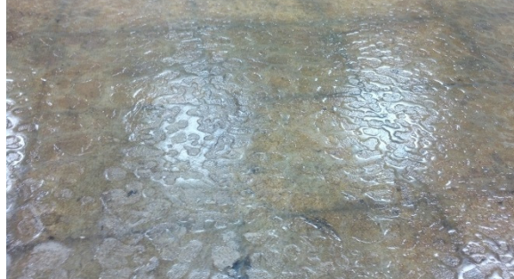
Result of contaminated Sub Floor

e) For possible organic or inorganic contamination see Technical Information #16