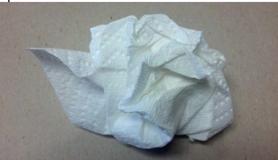
Clean Sub Floor

d) To check to see if a curing compound or sealer is on the concrete surface, place a water drop on the concrete and observe if the water beads. If so, then there is a compound on the concrete that needs to be removed. Remove the compound by grinding or shot blasting, vacuum and tack the floor. Then repeat the water drop test. Absorption should take place within 30-60 seconds.