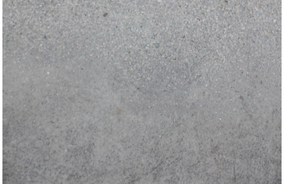
Clean Floor after Shot Blasting